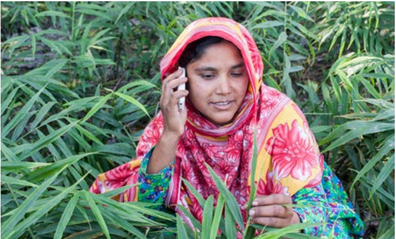
Small farmer in Bangladesh benefits from the telephone help line.

These examples demonstrate another very important point; Swisscontact's work is sustainable. Technicians are being trained in Chandigarh, India, and Benin to this day.