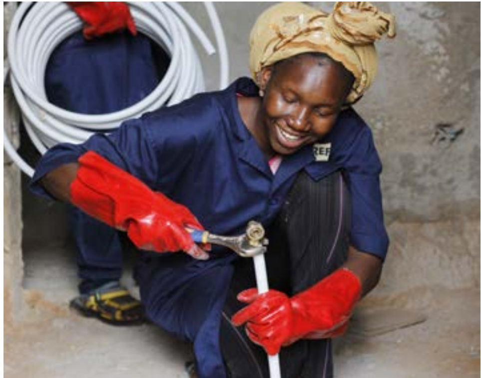
Skills development in Mali