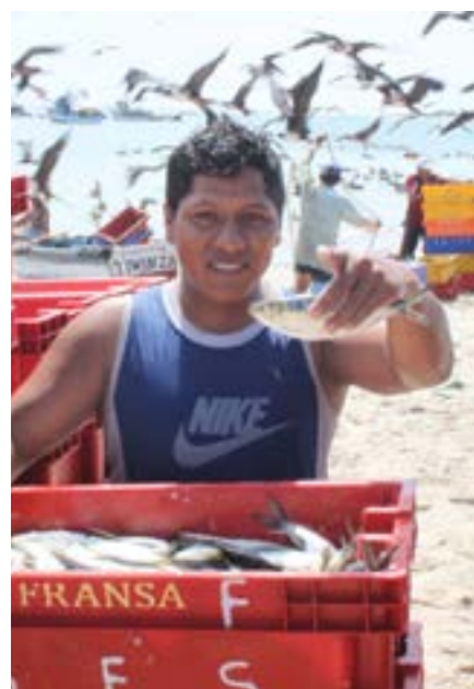
Support for fishing associations in Peru

Similar projects followed in Bolivia, Peru, Indonesia and Vietnam.