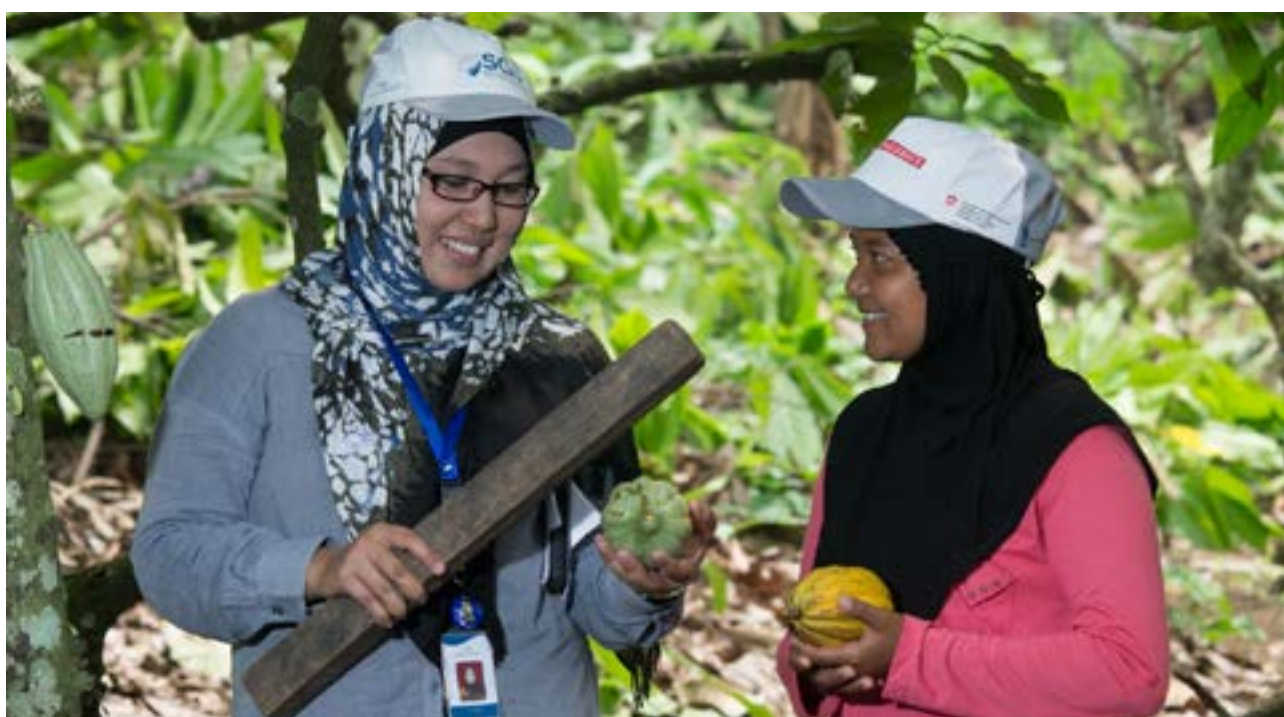
Cocoa farmers in Indonesia

CHANGE IS ESSENTIAL TO DEVELOPMENT. THE HISTORY OF SWISS-CONTACT DEMONSTRATES THIS. SINCE OUR FOUNDATION IN 1959, OUR WORK METHODS HAVE CHANGED AND WE HAVE ADDED NEW KEY AREAS OF FOCUS AND NEW PARTNER COUNTRIES, BUT THROUGHOUT THE LAST 60 YEARS OUR GOAL HAS REMAINED UNCHANGED: SWISSCONTACT HAS ALWAYS CREATED OPPORTUNITIES FOR PEOPLE TO LIFT THEMSELVES OUT OF POVERTY AND DEVELOP ECONOMICALLY.