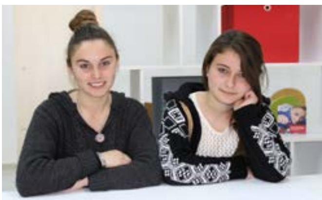
Students in Albania