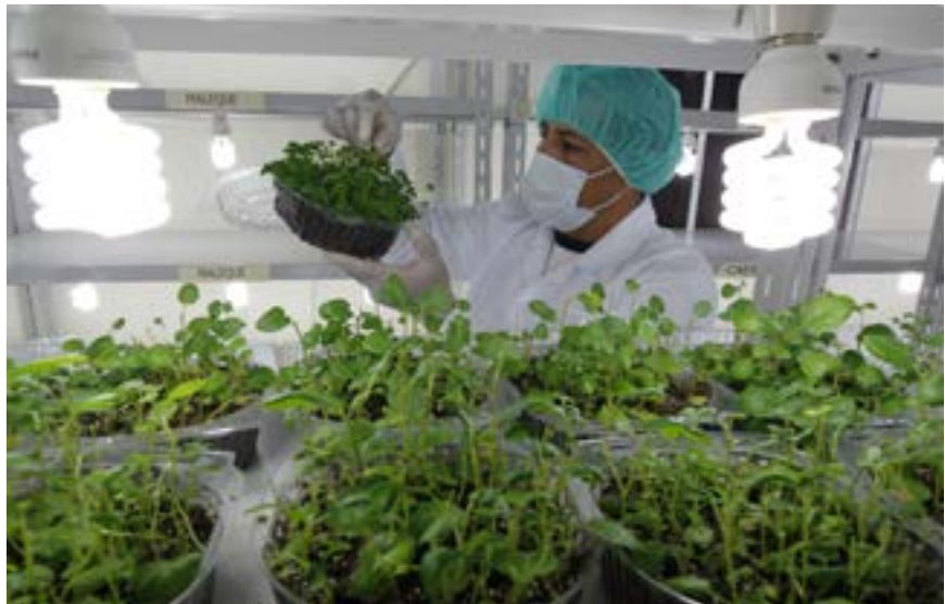
Promotion of small enterprises in agro-industrial value chains, Honduras