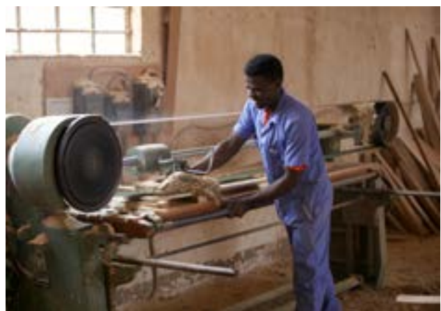
Skills Development in DR Congo

This is how Swisscontact will be prepared to face upcoming challenges, and in the future, we will continue to be able to implement our organisational objectives reliably, responsibly and deliver a quality contribution.