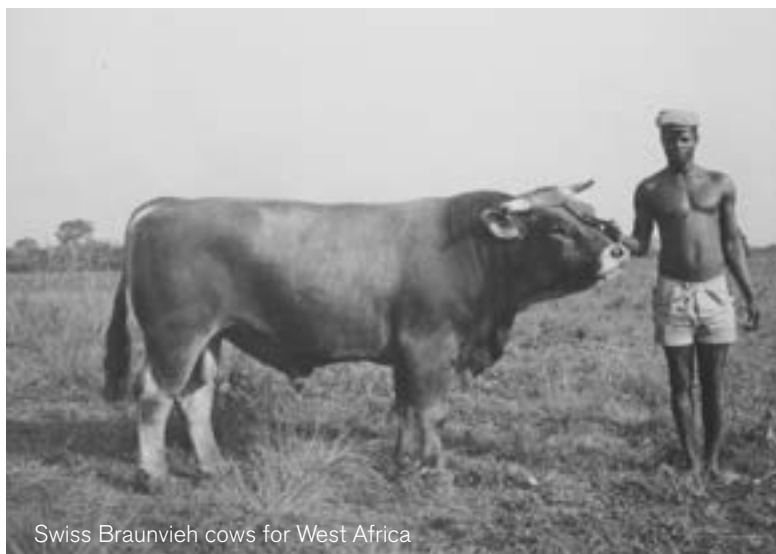
Swiss Braunvieh cows for West Africa

SWISSCONTACT'S PROJECT WORK HAS EVOLVED OVER THE PAST 60 YEARS. INITIALLY, SKILLS WERE TRANSFERRED FROM SWITZERLAND. THIS WAS BEFORE THE FOUNDATION CHANGED ITS APPROACH BY USING LOCAL RESOURCES INSTEAD. THIS BECOMES APPARENT WHEN WE COMPARE OUR WORK IN THE INITIAL PERIOD WITH OUR CURRENT PROJECTS. NONETHLESS, THE PRINCIPLE FOR SWISSCONTACT'S SUCCESS REMAINS THE SAME – PROJECTS ARE ALWAYS MARKET-FOCUSED. HERE, WE COMPARE OUR WORK IN INDIA AND BENIN THEN AND ALBANIA AND BANGLADESH TODAY.