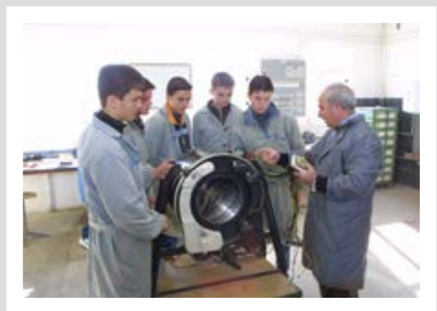
1993 - In Albania, Swisscontact makes its first foray into post-communist Eastern Europe.