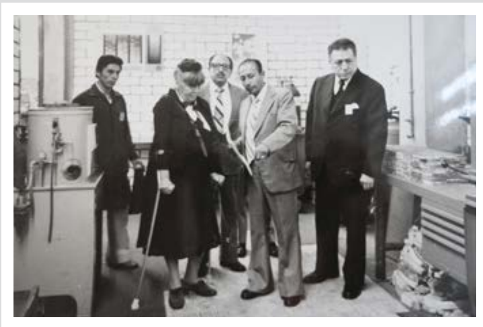
Swisscontact has been working in Peru since 1966. Peru is the first country in which Swisscontact has been implementing development projects uninterrupted for 50 years.