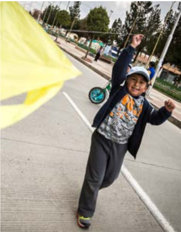
'Clean Air' for Bolivia

The positive results of the last few years show that with our '2020 Strategy' in 2012 we made the right decisions and are well positioned in the international development market. We enjoy the trust of our donors and partners. Nevertheless, we work in an ever-changing environment and considerable risks. Development work takes place in volatile and fragile political and economic systems. This means we must remain flexible in all our commitments. With its new strategic orientation, Swisscontact is investing in the future in order to remain a reliable and important development organisation for private and public donors.