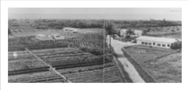
1963 - An agricultural training school is opened in Sékou (Dahomey, today Benin), as the Foundation's second project.