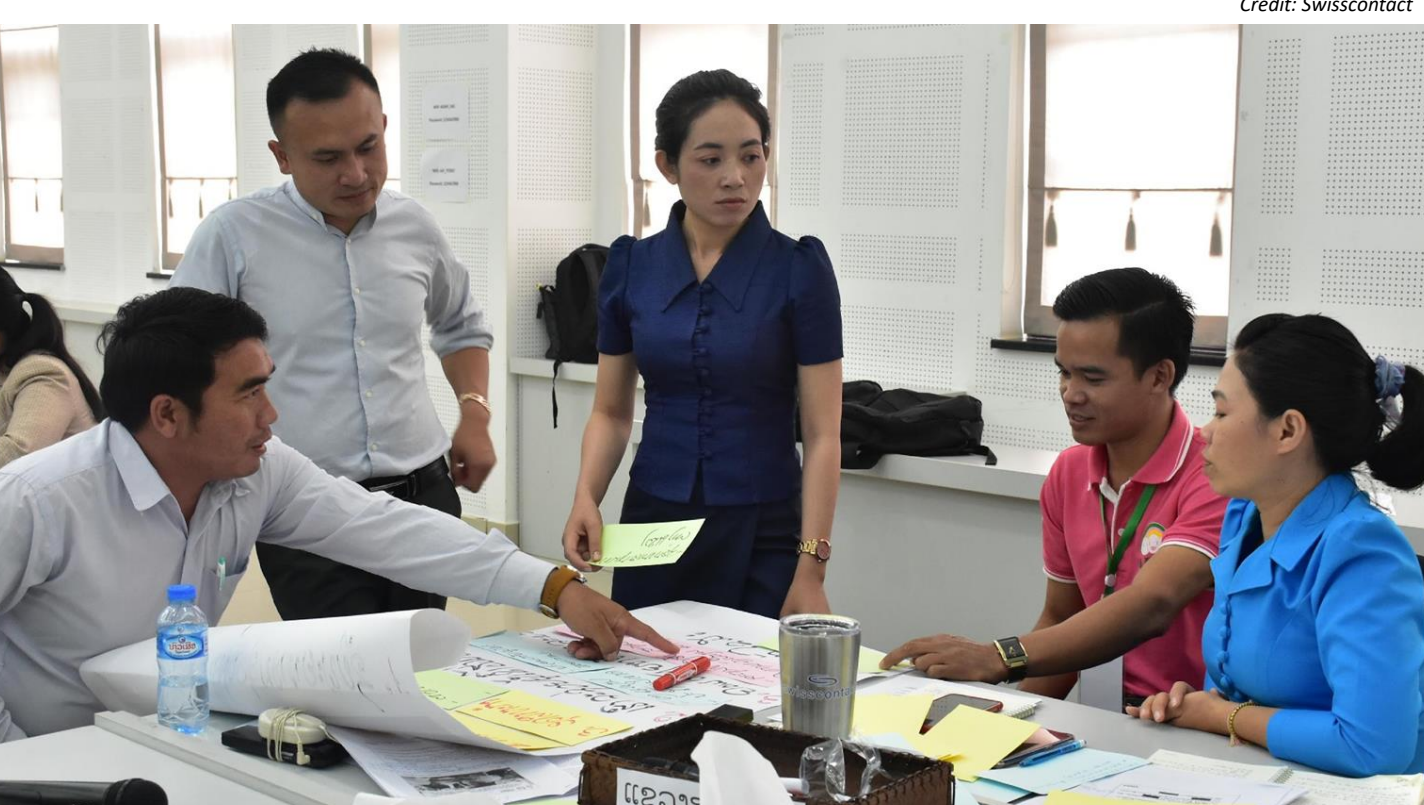
Image: IVET teachers brainstorming during a training session

Inception phase: August 2019 - March 2020 Project duration: (4 years) August 2019 - July 2023