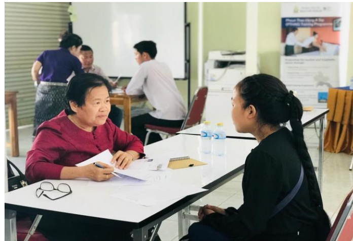
Image: Recruitment interview for the Enhanced PTHAS Programme.

At MP Café, she worked closely with the chef, who is also the owner of the café, to learn more about the job. She thrived, and after some time the chef trusted her to take over many of the responsibilities of running the kitchen. With a radiating smile she states, “I started as a Chef’s Assistant but now I’ve been promoted to Chef!”