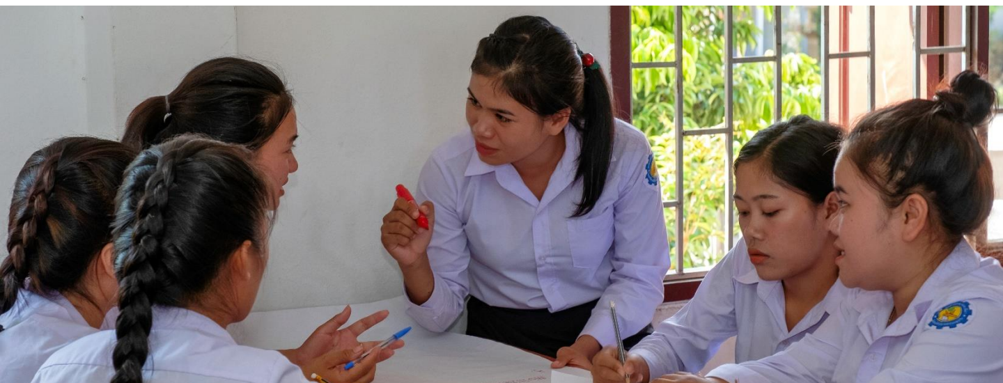
Below: PTHAS students during an activity.