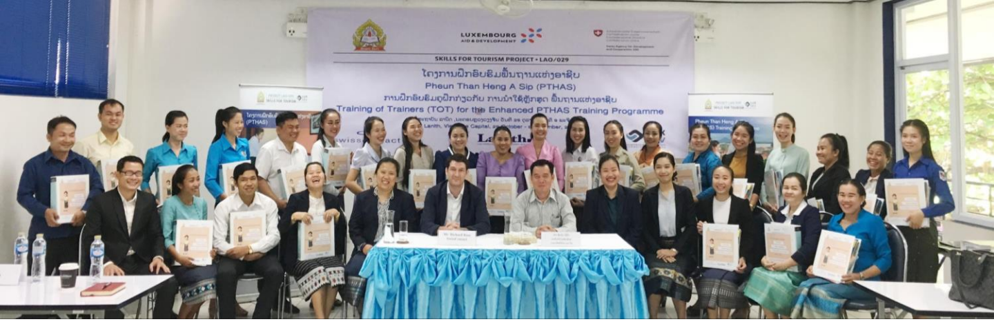
mage: Training of Trainers Completion Ceremony for TVET teachers at the former Lanith, Vientiane.

PTHAS places a high importance on preparing students for work in the private sector. Teachers arrange industry days and internships, and counsel students in collaboration with local businesses.